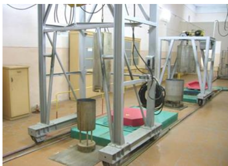
Figure 1 - Pool-type Gamma Facility [14]

For gamma radiation exposure of the samples, a pool-type Gamma Facility of the institute Nuclear Physics, Uzbek Academy of Science (INP UzAS) was used (Figures 1). In so doing, we have used the 60 Co sources with average gamma quantum energy of 1.25 MeV and a dose rate of 130 R/s, with an exposure dose ranging from 3.2×10 4 to 5.0×10 8 R. The choice of gamma irradiation is determined by its technological efficiency and high penetrating ability.