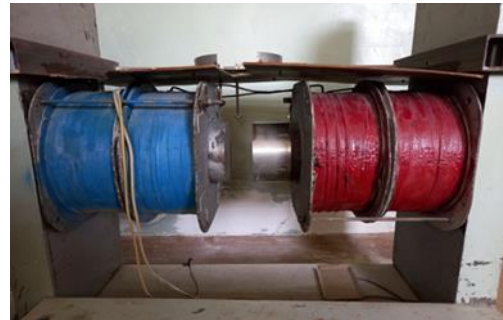
Figure 3 - Magnetic Field Inductors Mounted on a Magnetic Core

This design allows carrying out the treatment of entire drill bits and chisels with a pulsed magnetic field, which is a necessary condition for the method of enhancing the wear resistance of finished cemented carbide tools.